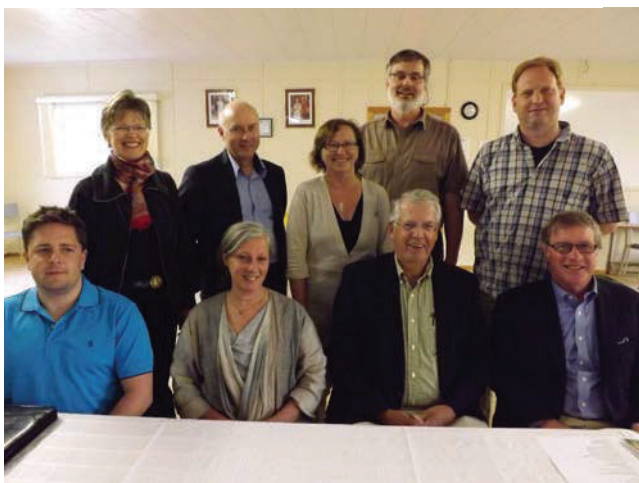
FCF Board of Directors and staff

“Thank you to all the supporters of our annual fundraising gala. You are too many to name. The funds raised support the foundation’s programs and services to the many non-profit organizations doing good work in Charlotte County!” FCF Board of Directors