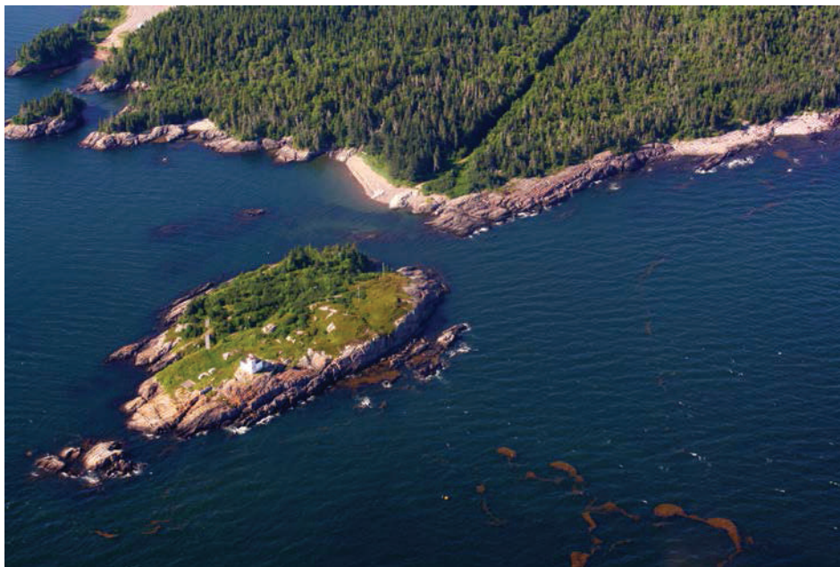
Connors Bros. Nature Preserve on Pea Point Nature Trust of NB

The Connors Bros. Nature Preserve on Pea Point was created in 2012. This project supports improvements to the entrance area, creation of a trail system plan, installing public infrastructure, a clean-up day, planting native tree species and other activities. The project has strong volunteer commitment and support from the Village of Blacks Harbour. $5,000