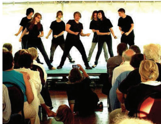
St. Andrews Arts Council Inc. Summer School for Performing Arts Bursaries for students from Deer Island

“Funding to Nature Trust of New Brunswick has helped ensure that The Connors Bros. Nature Preserve on Pea Point, created in 2012, is accessible to the public and more enjoyable for all. This project provides a great opportunity for local citizens and visitors to benefit from the unspoiled coast of the Bay of Fundy. Throughout this on-going project great partnerships have been with the local organizations, Village of Blacks Harbour, and Connors Bros.