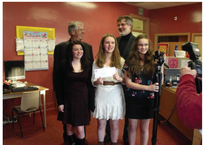
Giving feels so good! Bobcat TV youth accept 20 th Anniversary Grant to upgrade equipment.

This student run news program airs a 15-20 minute show weekly to 450 students of SSMS and is celebrating its 5 th year of production. The teacher supervisor volunteers ~400 hours/ year to the student cast and crew who put in ~6000 hours /year. The anniversary grant will assist with equipment upgrades. $5,000