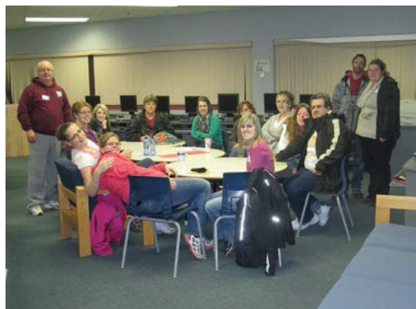
Families and Schools Together (FAST) Parent support group at FAST

Ross Memorial Library Fund The Mr. And Mrs. Delmar Leighton Fund The Mary S. Williamson Fund The Helen Strait Remer Fund The Marjorie Emerson Memorial Fund The Walter and Kitty Williamson Book Fund The Hatheway & Annie Fountain Family Memorial Fund The Dorothy and Kenneth Langmaid Animal Welfare Fund Roots of Empathy Fund Wall-Bain Charlotte County Museum Fund Frank and Eleanor Stymest Fund Karen Dorothy Foulkes Environmental Fund The J.T. Clark Family Foundation Inc. Fund for Dragonfly Ste-Croix 2004 Community Fund