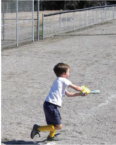
Charlotte County Sports for Kids Fund Batter up!

The following new endowment funds were established in 2013: