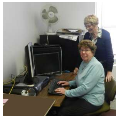
Charlotte County Archives Project