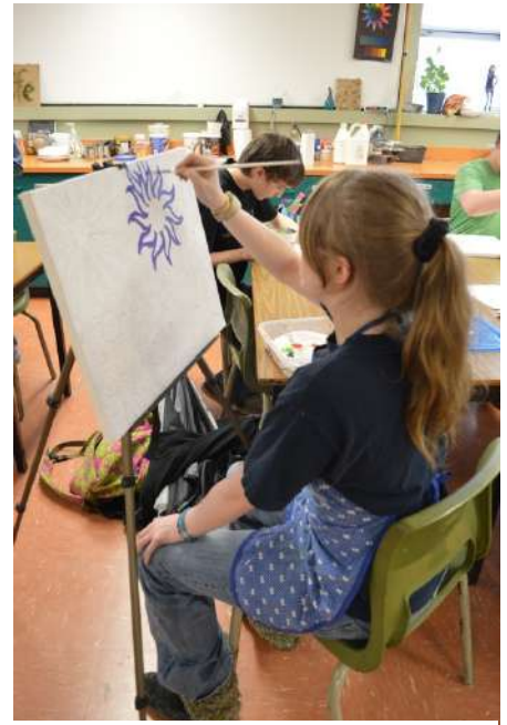
St. Stephen High School - Aspiring Painters Project - Anniversary Grant