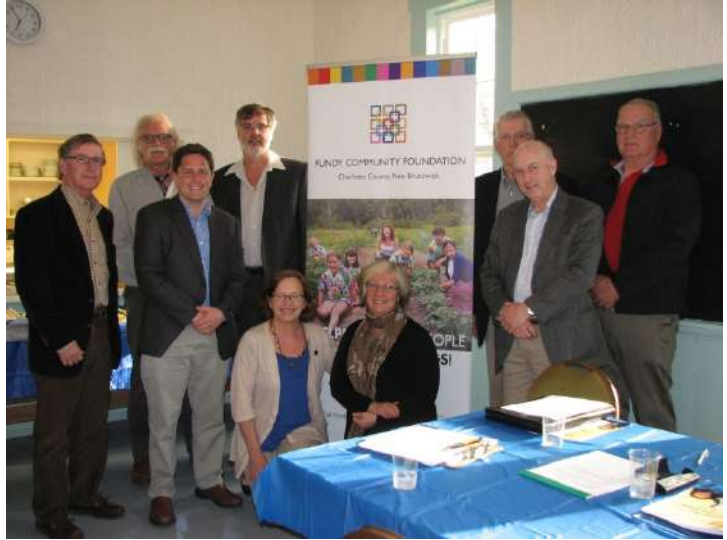
FCF Board of Directors - AGM 2014

Fundy Community Foundation is governed by a volunteer Board of Directors. Our Board of Directors govern, steward and grow a pool of endowment funds and other funds, make responsible grants and foster community leadership. They are committed and caring volunteers who work together to improve the quality of life for Charlotte County, NB. Our staff is dedicated to Fundy Community Foundation's mission and the Executive Director serves on all committees as a non-voting member.