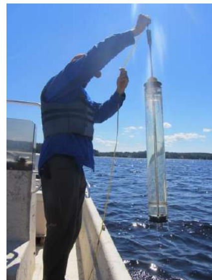
Eastern Charlotte Waterways CWLA Clean Water Initiative

Ross Memorial Library Fund The Mr. And Mrs. Delmar Leighton Fund The Mary S. Williamson Fund The Helen Strait Remer Fund The Marjorie Emerson Memorial Fund The Walter and Kitty Williamson Book Fund The Hatheway & Annie Fountain Family Memorial Fund The Dorothy and Kenneth Langmaid Animal Welfare Fund Roots of Empathy Fund Wall-Bain Charlotte County Museum Fund Frank and Eleanor Stymest Fund Karen Dorothy Foulkes Environmental Fund The J.T. Clark Family Foundation Inc. Fund for Dragonfly Ste-Croix 2004 Community Fund