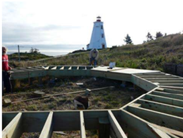
Building the commemorative deck at Swallow Tail

A Community Grant to Swallowtail Keepers Society Inc. helped to install two elements of an overall design scheme at the Swallow Tail lighthouse property on Grand Manan Island, a set of stairs and a commemorative deck. This is just one phase of a much larger project that has seen the restoration of the lighthouse and accompanying buildings and grounds.