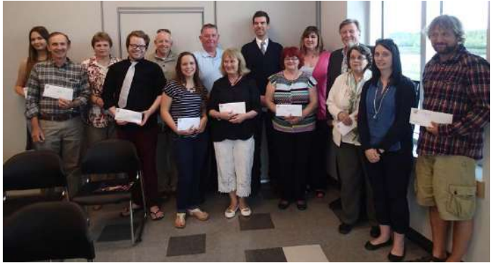
Community grant presentation at the Garcelon Civic Centre, St. Stephen, NB

Fundy Community Foundation is governed by a volunteer Board of Directors. Our Board of Directors govern, steward and grow a pool of endowment funds and other funds, make responsible grants and foster community leadership. They are committed and caring volunteers who work together to improve the quality of life for Southwest, NB. Our staff is dedicated to Fundy Community Foundation's mission and the Executive Director serves on all committees as a non-voting member.