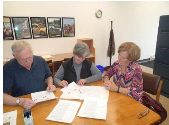
Reaching out to McAdam - McAdam Railway Station Fund

Ross Memorial Library Fund The Mr. And Mrs. Delmar Leighton Fund The Mary S. Williamson Fund The Helen Strait Remer Fund The Marjorie Emerson Memorial Fund The Walter and Kitty Williamson Book Fund The Hatheway & Annie Fountain Family Memorial Fund The Dorothy and Kenneth Langmaid Animal Welfare Fund Roots of Empathy Fund Wall-Bain Charlotte County Museum Fund Frank and Eleanor Stymest Fund Karen Dorothy Foulkes Environmental Fund The J.T. Clark Family Foundation Inc. Fund for Dragonfly Ste-Croix 2004 Community Fund McAdam Railway Station Fund Dick Saunders Memorial Fund