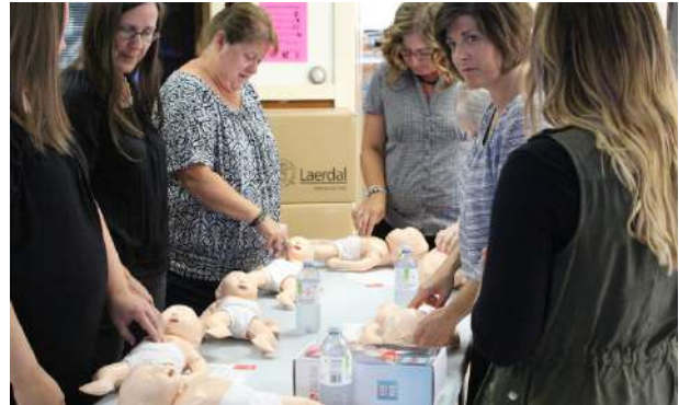
Heart and Stroke Foundation of NB Infant CPR Anytime

The Charlotte County Resource Centre (CCRC) recognized a need for Infant CPR training given the rural area being served but did not have the necessary CPR kits or training. Through a partnership with the Heart & Stroke Foundation of New Brunswick and a community grant from Fundy Community Foundation, the kits and training became a reality for parents and caregivers in St. Stephen and CCRC satellite sites in Grand Manan, Campobello, Deer Island, Lawrence Station, St. George and St. Andrews.