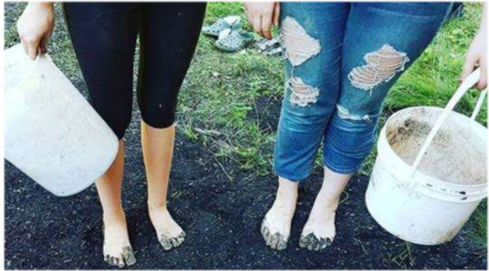
Boys and Girls Club of Charlotte County, Leaders in Training program, promotes youth volunteering including volunteer gardening.

Brian Eric Magee Memorial Fund The Redmond Trust Fund The Flemer Fund The Norma and James Davies Fund The Richard and Margaret Saunders Family Fund The Arthur B. MacLeod Memorial Fund The Beaverbrook Canadian Foundation Fund The Richmond and Mabel Steeves Memorial Fund The Nora Magee Breese Fund The J.T. Clark Family Foundation Inc. Fund The Cuthbertson Family Fund The Kane Family Fund The Bryce Family Fund The Barbara and Bill Stanley Fund John Anderson Fund Smart & Caring Community Fund Margaret Raymonde Peterson Memorial Fund The Community Fund The Chang-Lewis Fund