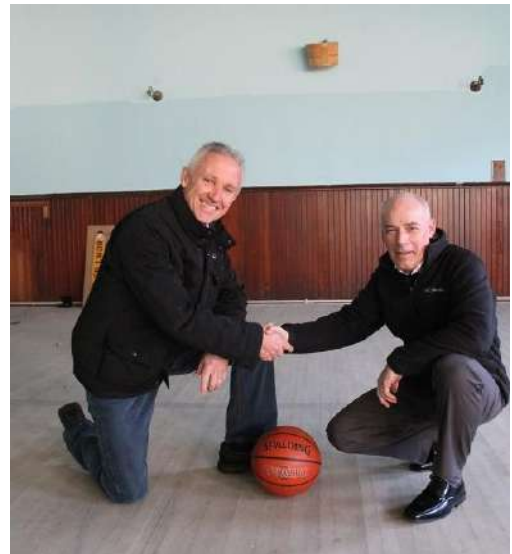
Canada 1 st Basketball Project

The Town of St. Stephen partnered with Canada 1 st Basketball Inc. on a Community Fund for Canada's 150 th (CFC150) project "Canada 1 st Basketball Development Plan for a Proposed Museum". The goal is to preserve and protect the oldest existing basketball court in the world, located in the oldest existing Canadian YMCA location. Many of the original features of the basketball court have been preserved. A professional development plan is now complete and lays the foundation for development of a basketball museum in the Town of St. Stephen, NB.