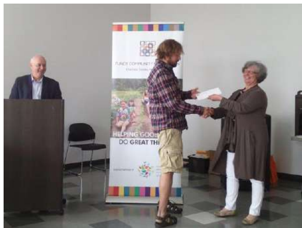
Community grant presentation at the Garcelon Civic Centre, St. Stephen, NB

Fundy Community Foundation is governed by a volunteer Board of Directors. Our Board of Directors govern, steward and grow a pool of endowment funds and other funds, make responsible grants and foster community leadership. They are committed and caring volunteers who work together to improve the quality of life for southwestern, NB. Our staff is dedicated to Fundy Community Foundation's mission and the Executive Director serves on all committees as a non-voting member.