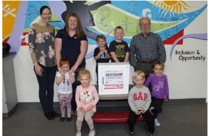
Heart and Stroke Foundation of New Brunswick placement of AED at the Boys and Girls Club of Charlotte County

Brian Eric Magee Memorial Fund The Redmond Trust Fund The Flemer Fund The Norma and James Davies Fund The Richard and Margaret Saunders Family Fund The Arthur B. MacLeod Memorial Fund The Beaverbrook Canadian Foundation Fund The Richmond and Mabel Steeves Memorial Fund The Nora Magee Breese Fund The J.T. Clark Family Foundation Inc. Fund The Cuthbertson Family Fund The Kane Family Fund The Bryce Family Fund The Barbara and Bill Stanley Fund John Anderson Fund Smart & Caring Community Fund Margaret Raymonde Peterson Memorial Fund The Community Fund The Chang-Lewis Fund R. Allyn Jackson Memorial Fund The Vottero/Field Family Fund Ste-Croix 2004 Community Fund