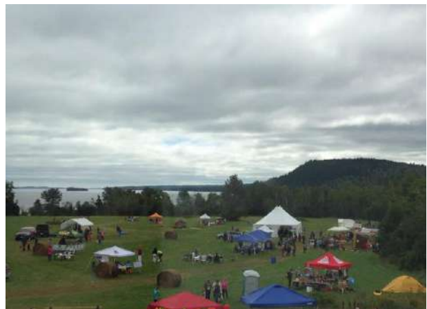
Ganong Nature Park

Ganong Nature Park Fund (Agency Designated) R. Allyn Jackson Memorial Fund (Community) The Vottero/Field Family Fund (Community) St. Croix Estuary Project Inc. Fund (Managed)