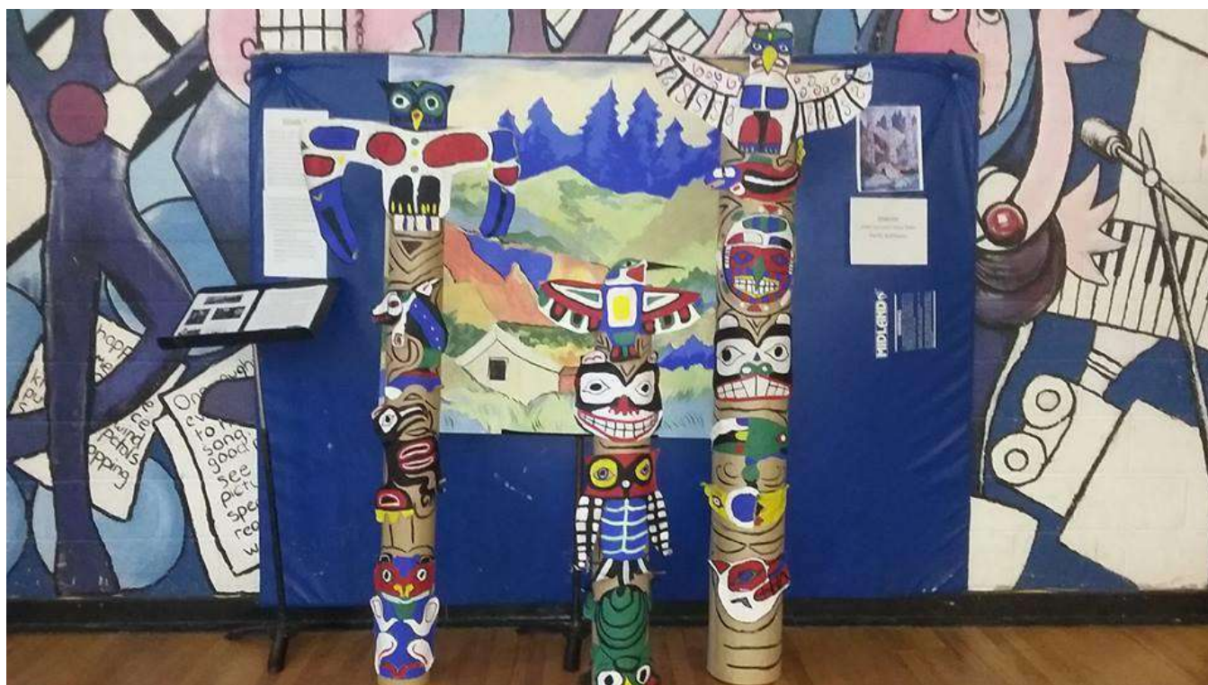
St. Andrews Arts Council Inc Honouring our indigenous peoples, a CFC150 project

Fundy Community Foundation made grants totaling $74,284.23 beyond Community Grants. Grants from multiple funds to a single organization appear as one lump sum.