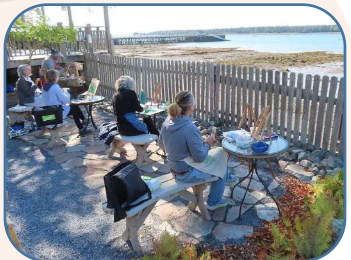
Art for Mental Health — Sunbury Shores Arts and Nature Centre