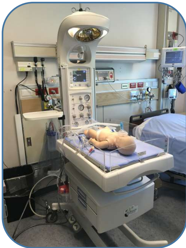
Transportable Radiant Warmer — Charlotte County Hospital Foundation Inc.

N.B. Teachers' Association Branch 1023 Scholarship Fund