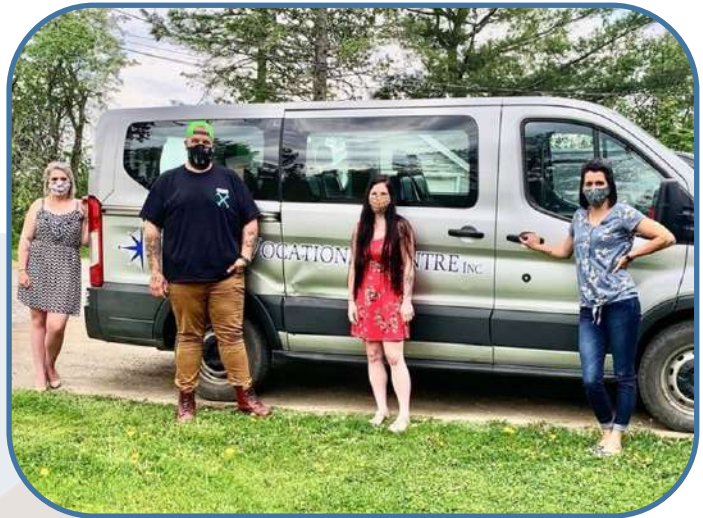
Operation Clean Eating — St. Croix Vocational Centre