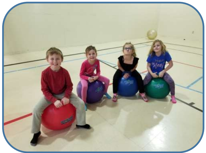
Get Moving Moving — Boys and Girls Club of Grand Manan Island