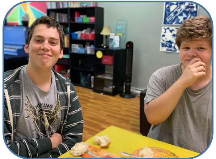
Youth Centre — Boys and Girls Club of Charlotte County

YMCA of Greater Saint John Rainbows: $1,085