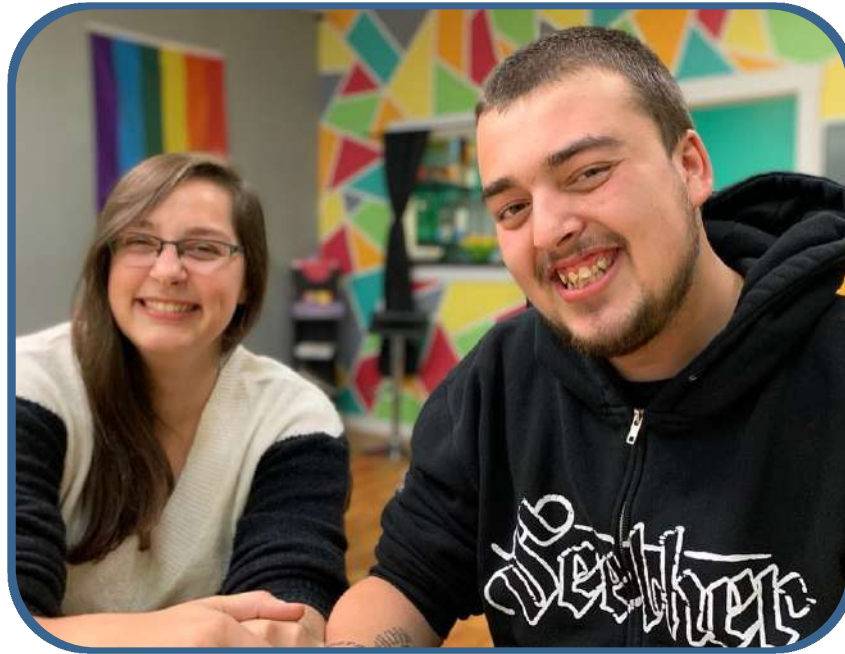
Youth Centre — Boys and Girls Club of Charlotte County