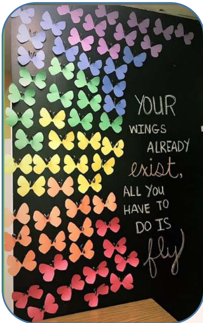
Youth Centre — Boys and Girls Club of Charlotte County