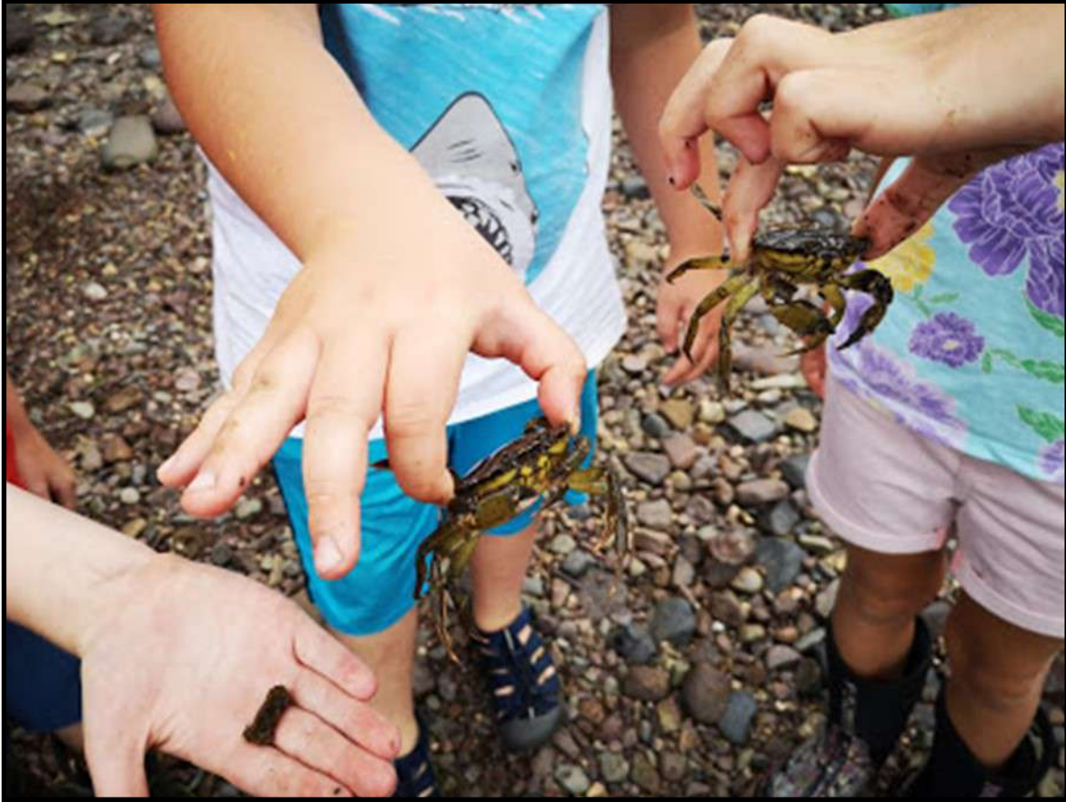
Sunbury Shores Arts and Nature Centre—SCAMPS Summer Camp Art Mornings Project