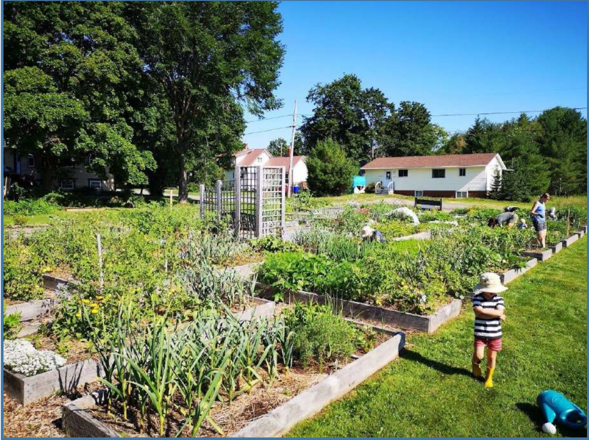
Victoria Street Community Garden Project — St. Croix Vineyard Inc.