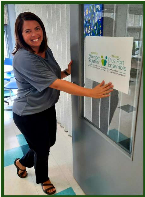
Working Stronger Together: St. George Community Hub - Internet Café