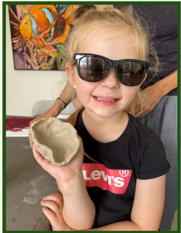
Dragonfly Centre for Autism - Art Therapy