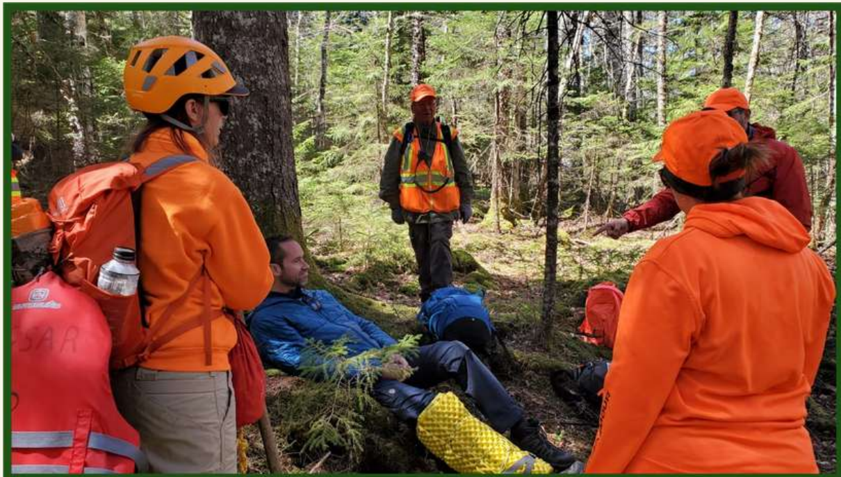
Charlotte County Ground Search and Rescue Team participates in a joint training day with the St. Andrews Fire Department on Ministers Island.