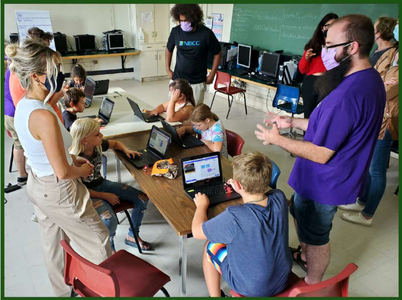
STEAM Camps 2022 - Brilliant Labs Inc.