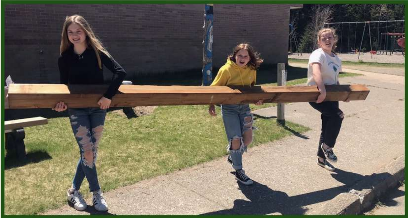
Students at Deer Island Community School help with the construction of their new outdoor learning shelter.